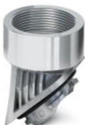
Adapter, aluminum, for EVO housing, NPT-1, 1" thread

Please be informed that the data shown in this PDF Document is generated from our Online Catalog. Please find the complete data in the user's documentation. Our General Terms of Use for Downloads are valid ( http://phoenixcontact.com/download )