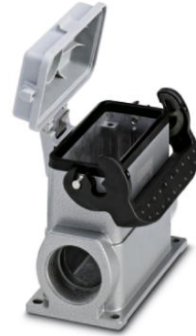
Figure shows product variant without screw connection

http://eshop.phoenixcontact.de/phoenix/treeViewClick.do?UID=1771697