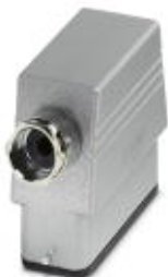
Sleeve housing, for single locking latch, height 72 mm, with screw connection, 1x Pg16, lateral cable entry

Please be informed that the data shown in this PDF Document is generated from our Online Catalog. Please find the complete data in the user's documentation. Our General Terms of Use for Downloads are valid ( http://phoenixcontact.com/download )